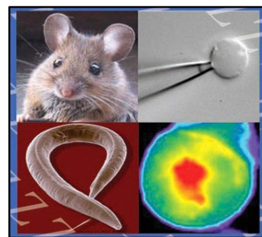
Division of Basic Research

“Phosphorylation Mechanisms for Chronic Pain in Sickle Cell Disease”