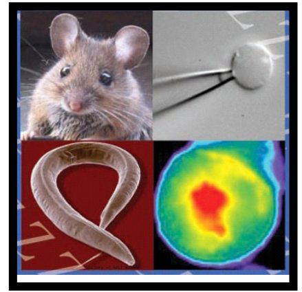
Division of Basic Research

Regulation of Anterograde Transport of the Kappa Opioid Receptor