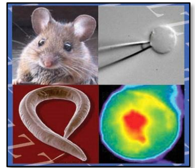
Division of Basic Research

“Synaptic Mechanisms maintaining persistent cocaine and methamphetamine craving”