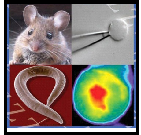
Division of Basic Research